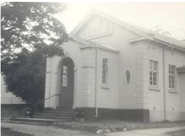
The Vumba Memorial Church