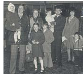
The Evans and McCann families