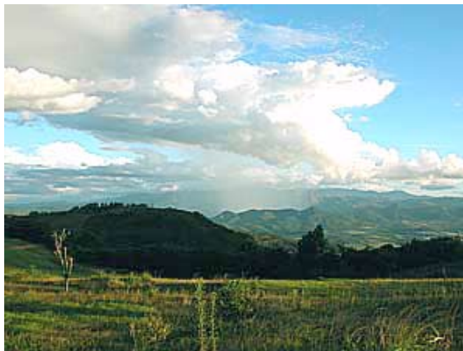
Vumba Mountains in Zimbabwe

The situation became more serious and moving became imperative. A member of the International Missions Board was sent to discuss the possible move