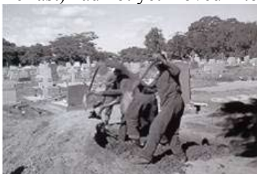
Digging the graves